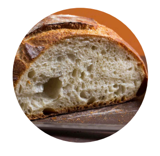
Become a baker like Thomas Farriner and bake your own bread.