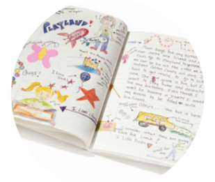
Become like Samuel Pepys and write or draw a diary for a week.