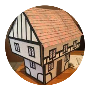
Make your own 2D/3D Tudor houses using materials of your choice.