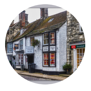
Walk round your local area. Which buildings are old? Which are more modern?