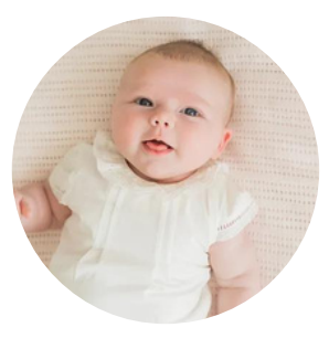
Look at photos of you when you were younger. How have you changed?