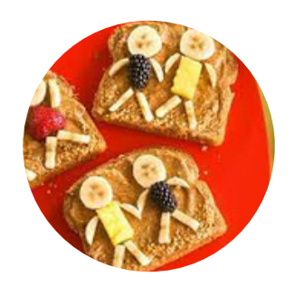
Make and eat a healthy snack or meal.